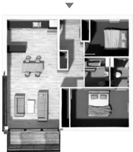
Artists impression of apartment