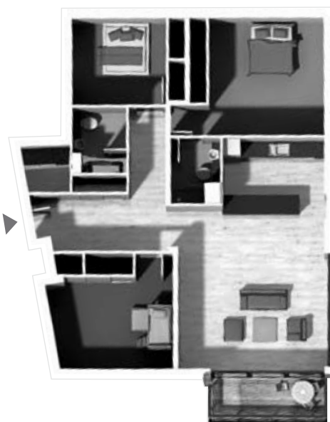
Artists impression of apartment