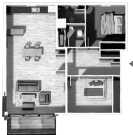
Artists impression of apartment