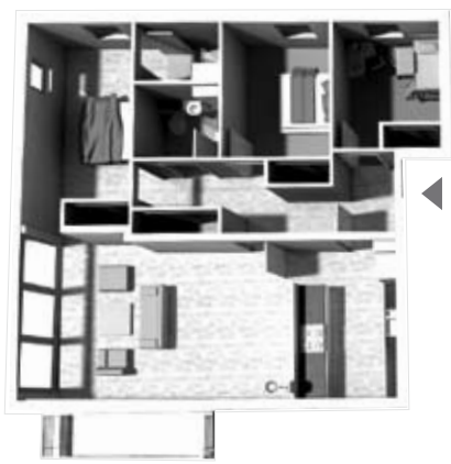
Artists impression of apartment