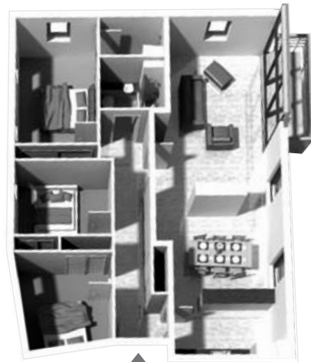
Artists impression of apartment