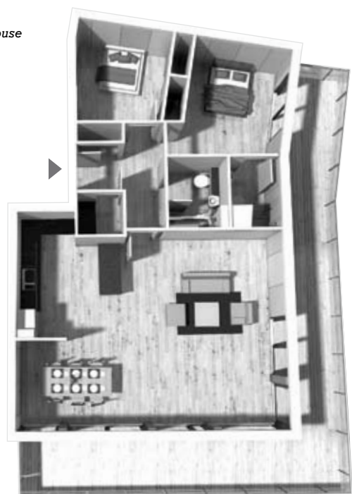
Artists impression of apartment